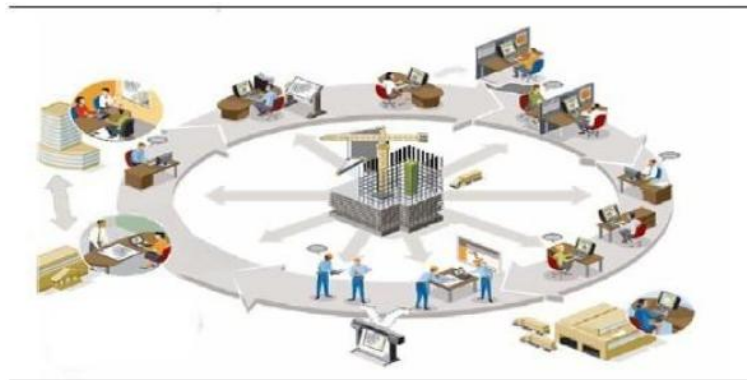
Figure 3 BIM technology

easy to cause the environment to be polluted, how to protect our living environment at the same time of steady development is also a serious problem that our country is thinking about at present. To this, our country has put forward the national green environmental protection development idea. In order to better respond to this development concept, construction enterprises must reflect the energy saving, environmental protection, green and low carbon in the process of building design.