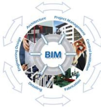
Figure 1 BIM technical features